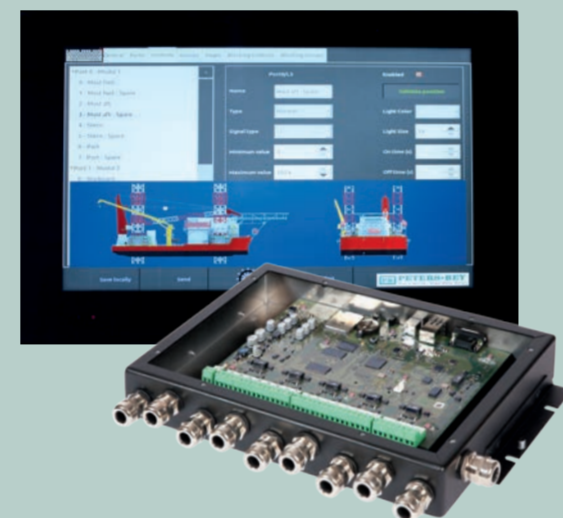
Navigation light – automatic signal unit, monitoring and control system, touch screen version

This freely programmable control system is the only one in the world able to detect conventional and LED navigation lights at the same time. Connection to BAM/CAM system or VDR (single listener) with IEC61162-450 – ethernet or connection to BAM/CAM system or VDR (single listener) with IEC61162-1 – interface is our normal standard. MED, DNV/GL, BSH approvals are available.